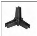
3-way corner joint