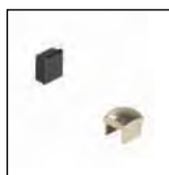
End caps - plastic or metal