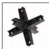
6-way corner joint