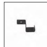
Removable shelf support