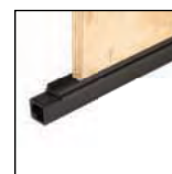
Cladding and glazing extrusions