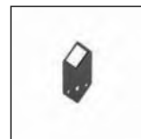
Single shelf support