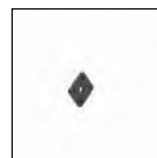
Plastic shelf spacer