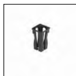
Black, White or Clear Inserts