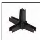
4-way corner joint