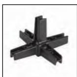
5-way corner joint